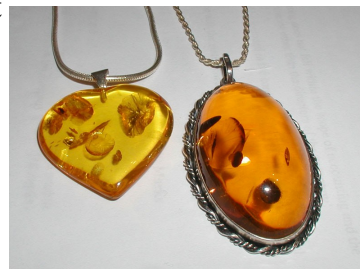
Illustration 1: Amber pendants

What they did realize was that sometimes two objects would attract each other, sometimes they would repel.