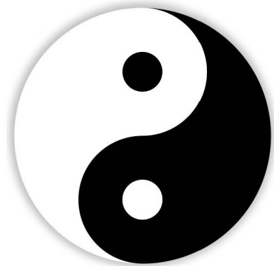
Illustration 3: The concept of Ying and Yang is a classic Chinese idea that nothing is entirely one thing... there is always a bit of the opposite included.

This leads us to the current way of describing light, the model known as Wave-Particle Duality .