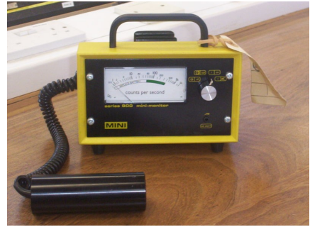
Illustration 1: A Geiger counter.