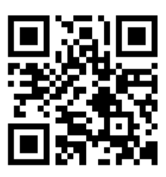
TI 83 and TI 84